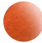
21 - Copper