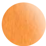
24 - Pale Gold