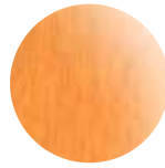
23 - Rich Pale Gold