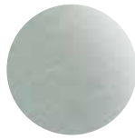
15 - Silver