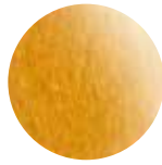
11 - Rich Gold