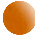
12 - Ducat Gold